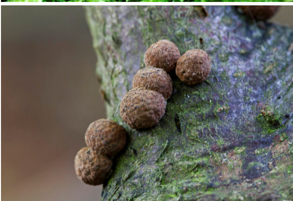
Left: Hypoxylon fragiforme , a very common species only occurring on fallen Beech branches.

.... and finally probably the commonest of the four species of asco shown here: Hypoxylon fragiforme (Beech woodwart). In this area most fallen branches of Beech are likely to have this fungus.